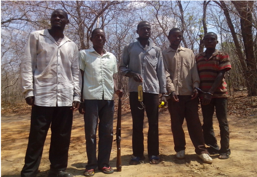
Tools of the trade - ivory, .303 rifle, tape measure, ammo and scale