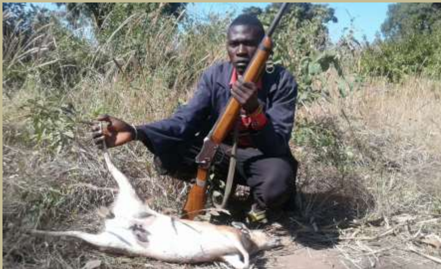
*** A poacher with his duiker***