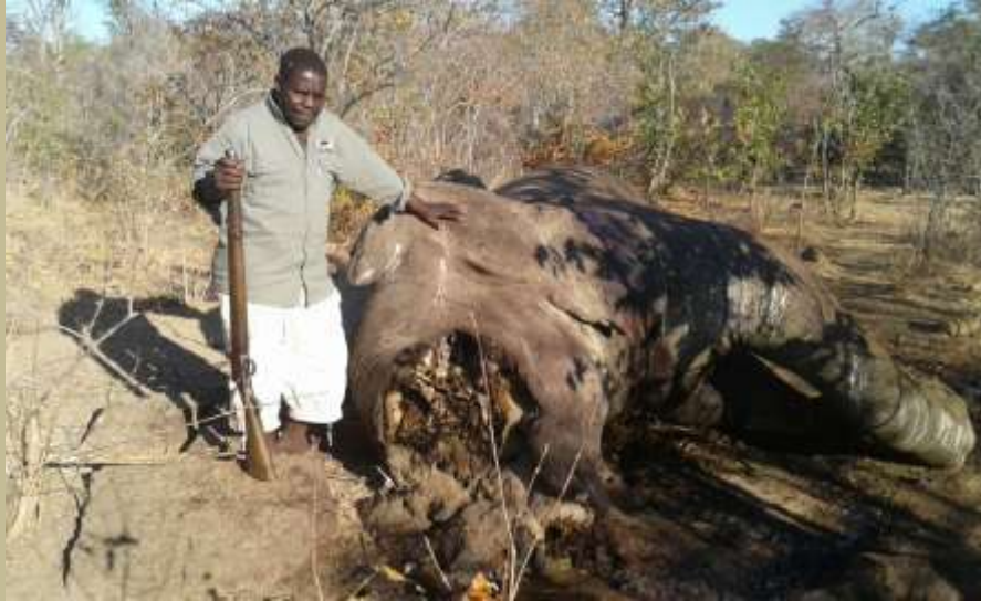
*** Muno with one of the poached ele's***