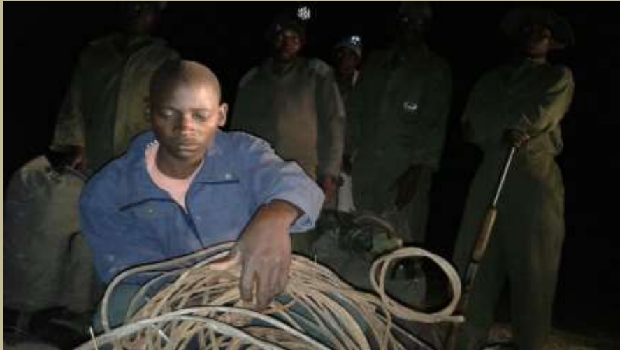
*** The worst kind – cable snares for buffalo and elephant calves - Cable taken from a vandalized foreign Aid project***.